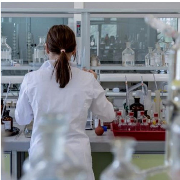
We're working with labs at EPA and the University of Washington.

We're also partnering with the EPA Region 10 Manchester Laboratory on a two year project to use DNA to identify sources. We plan to start in the fall of this year. We tried this method in 2010, but the science was still very new and our results were not as reliable as we had hoped. Though there are still many questions about the method's reliability, projects around the region are showing that it is worth trying again. We'll keep you posted on the results!